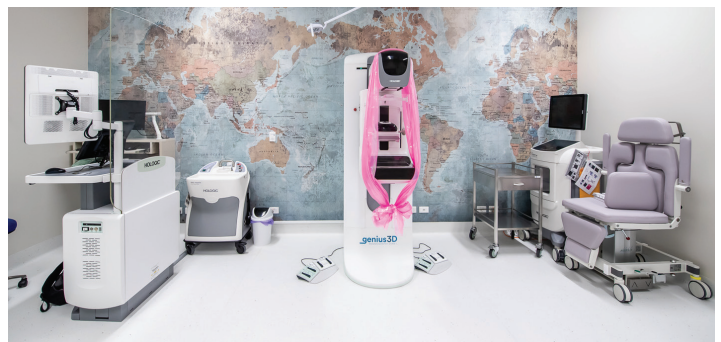
Imaging room at Joondalup Clinic