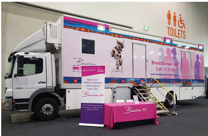
Mobile screening unit Boronia at the Expo

EveryWoman Expo was a great success for BSWA again this year, as the Boronia truck visited for the second year running. EveryWoman Expo, held from June 17-19, at the Perth Convention and Exhibition Centre, is an Expo of over 150 businesses featuring health, beauty, fashion, food, love, lifestyle, fitness, spiritual solutions and more. Popular attractions include fashion catwalks, empowering seminars, cooking demonstrations, beauty advice, psychic readings and more. This year, BSWA staff were more prepared than ever and ready to screen as many women as possible. Last year, 136 women were screened.