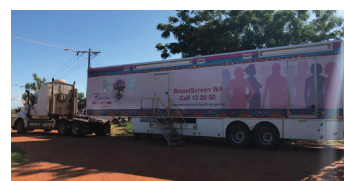
Trailer 3 Desert Rose

In the last few months BSWA has organised many block booking appointments for rural and remote Aboriginal women to attend their nearest mobile clinic while