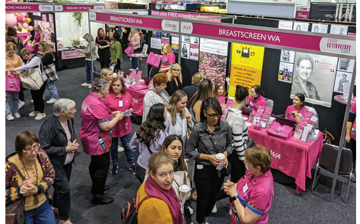
View of Expo from the truck

BreastScreen WA's screening truck, Boronia, was on-site with Screening Services staff to screen eligible women across the weekend, with the support of Administration and Health Promotion staff who booked eligible women in for their appointments. At the end of the weekend, 180 women were screened on the truck at the event, and overall 380 were booked for appointments at the Expo or at one of the 12 permanent BreastScreen WA clinics. The organisation's presence was definitely eye-catching with the large pink truck, pink information booth and merchandise garnering the attention of hundreds of people who walked by, many who expressed they were grateful for BreastScreen WA making the service so convenient and accessible.