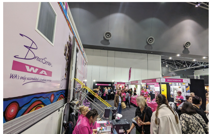
Truck on the Expo floor