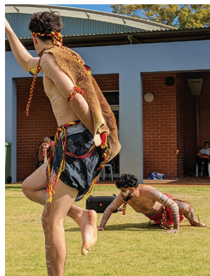
NAIDOC Week festivities

Staff and patrons enjoyed the festivities with Welcome to Country ceremonies, traditional tucker, hand painting, live music and dancing, including traditional dance performers as pictured below. The Health Promotion team made 26 bookings across the events.