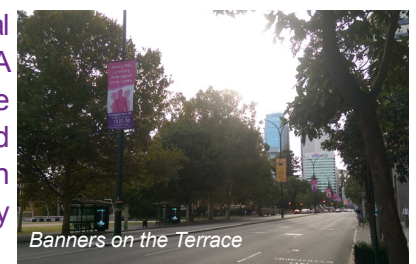
Banners on the Terrace

To celebrate International Women's Day the BSWA banners lined the Terrace for a week that culminated in an Information booth in Forrest Place on Friday 11 March.