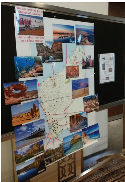
Promoting working on the BSWA mobiles

BreastScreen WA and the Australian Society of Medical Imaging and Radiation Technologists look forward to the 10 th anniversary meeting due to be scheduled in Perth in late 2020.