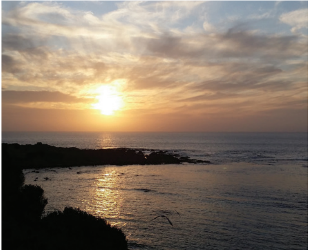
Yallingup sunset

Some examples below are from staff photos that are displayed in the Mandurah Clinic.