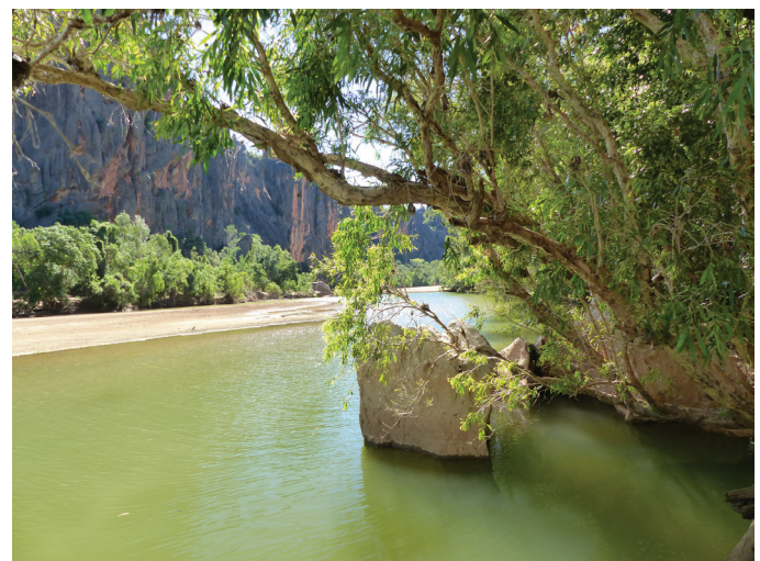
Windjana Gorge