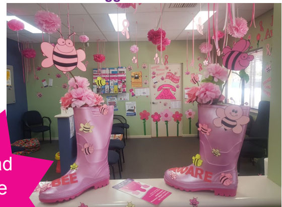
Three Springs Medical Centre