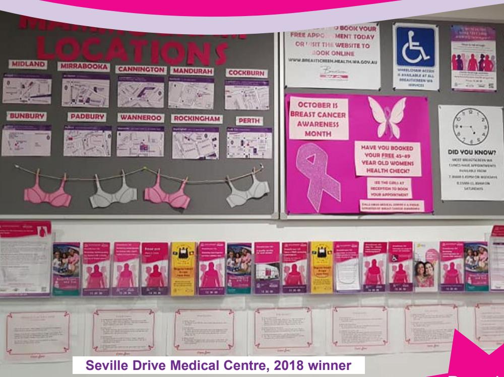
Seville Drive Medical Centre, 2018 winner