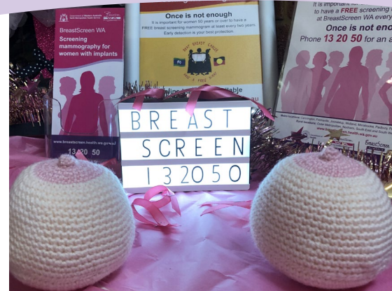
Trigg Health Care