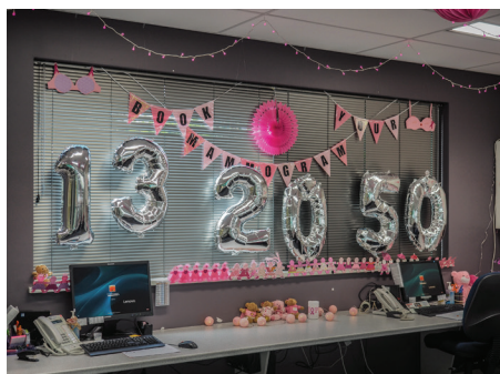
Australind and Eaton Medical Centres

Many GP practices in WA took up the challenge in 2017 to "be in the pink" and participate in BreastScreen WA's Health Promotion in the Practice to promote Breast Cancer Awareness during the month of October.