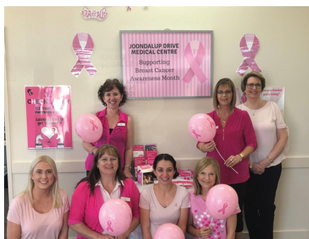
Joondalup Drive Medical Centre