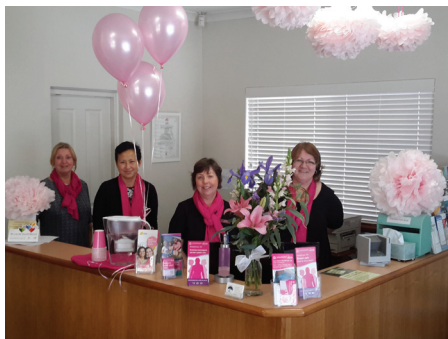
Bicton Palmyra Medical Practice