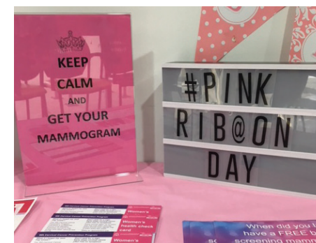
Ocean Village Medical Centre