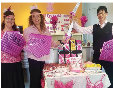
Queens Park Medical Centre