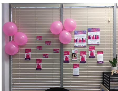
Oasis Drive Medical Centre