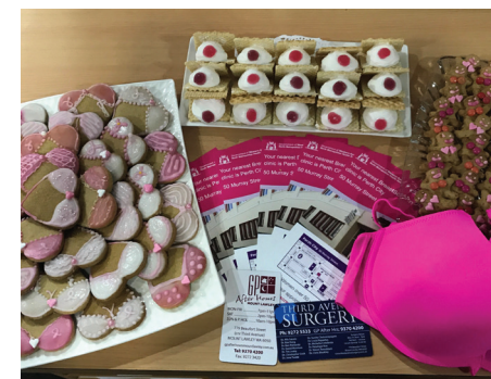
Third Avenue Surgery