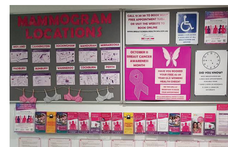
Seville Drive Medical Centre

BreastScreen WA would like to thank all GPs and practice staff for participating in the 2017 competition and promoting breast awareness and the importance of screening in their local community.