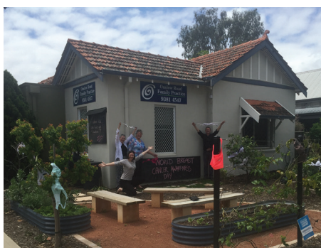
Onslow Road Family Practice