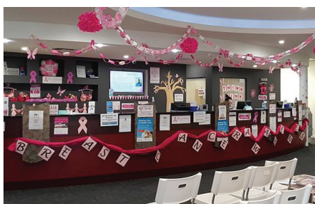
Seville Drive Medical Centre