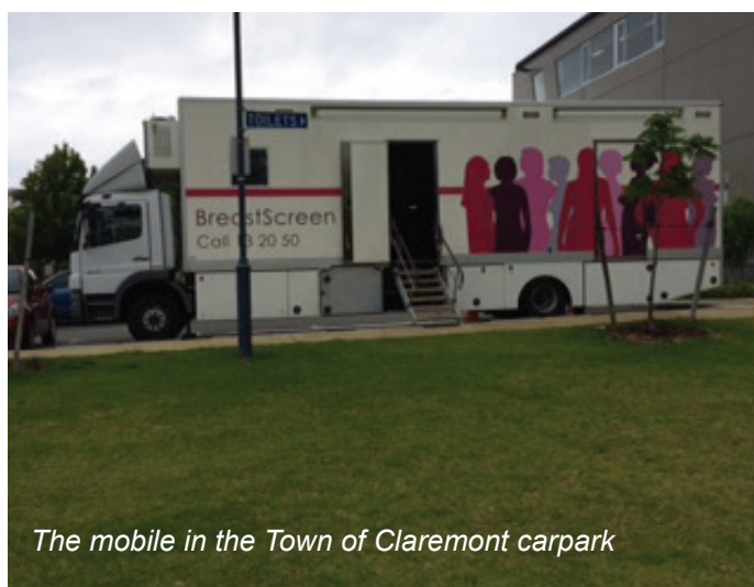
The mobile in the Town of Claremont carpark

BreastScreen WA is pleased to continue this initiative in 2018 with the mobile going to LeisureFit Booragoon 5-16 February, with the option to continue for another week.