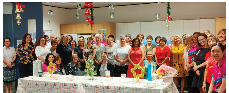
Staff of BreastScreen WA & guests from WNHS Executive