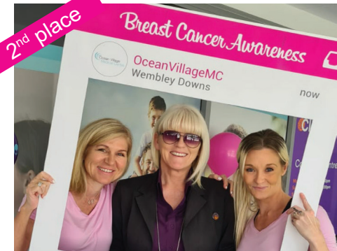
Ocean Village Medical Centre