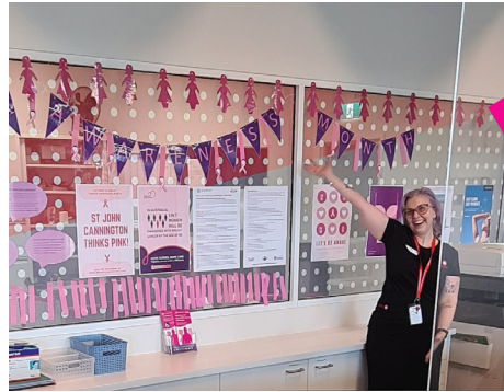
St John WA Medical, Dental & Urgent Care Beckenham