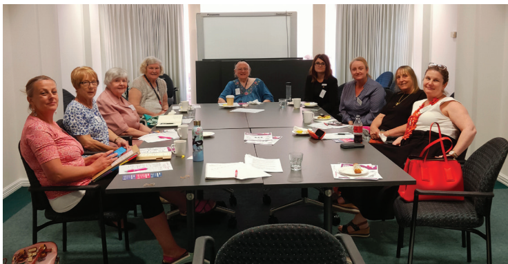
Final Consumer Reference Group meeting for 2021

The final Consumer Reference Group (CRG) meeting for 2021 was held on 25 November. On behalf of BreastScreen WA we Thank You for your commitment to, and participation in, the CRG for 2021. Without the knowledge, expertise and advocacy you all provide to our service would not be nearly as successful in engaging women in mammography screening. Wishing you a safe and wonderful Christmas and New Year. Looking forward to a successful CRG in 2022.