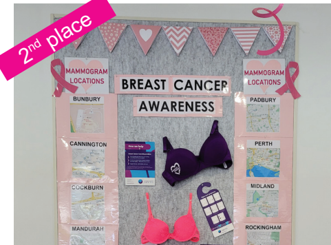
Ocean Village Medical Centre

The judging committee were impressed with the high standard of displays from all finalists!