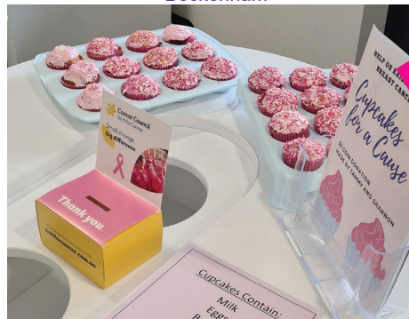
St John WA Medical, Dental & Urgent Care Beckenham