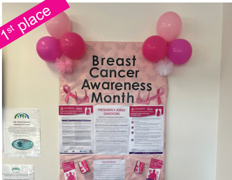
Ravenswood Family Practice