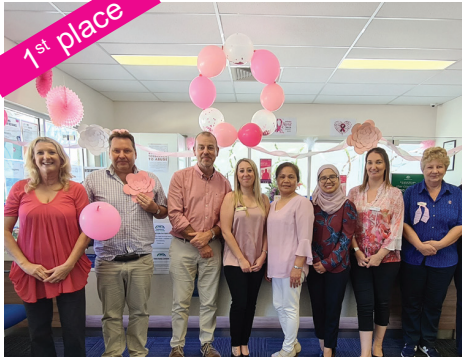
Ravenswood Family Practice

Thank you for participating in the 2021 competition and promoting breast awareness and the importance of screening to your local community.