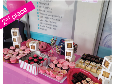
Ocean Village Medical Centre