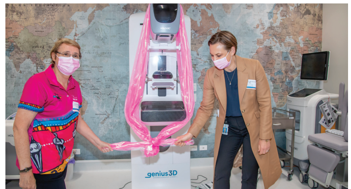
Carolyn Madeley Chief MIT and Hon Amber-Jade Sanderson, Minister for Health

The new facility will be able to perform 11,000 screens per year, as well as provide diagnostic mammography, ultrasound, and biopsy services. Murals featuring a world map and images from around the world cover the walls of screening rooms, and the ceilings of ultrasound rooms to help bring comfort to women during their screening and/or assessment. Women waiting for assessment will be able to relax in their own kitchen area, featuring a library of books, puzzles, knitting, and art supplies to occupy themselves while enjoying a cup of tea or coffee. Additional photos from this wonderful event can be seen on the back page.